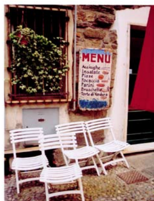
One of the few cafes in the tiny village of Vernazza, Cinque Terra

In Italy - the food was sublime, especially in the little village of Vernazza which clings to the steep cliffs on the Cinque Terra. There we savoured freshly made pasta that melted in your mouth, simple rustic pizzas, delicate pastries and coffee to ensure a lifetime addiction. And the gelati - my goodness - whilst not a fan before, I am a total convert now.