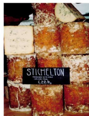
"Some cheese please"... just one of the myriad things to try at the Borough Markets, London